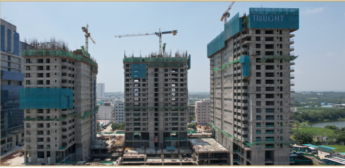
Actual Image Shot on Location