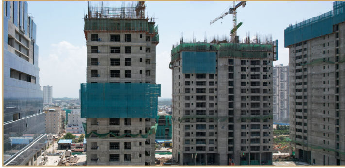
Actual Image Shot on Location